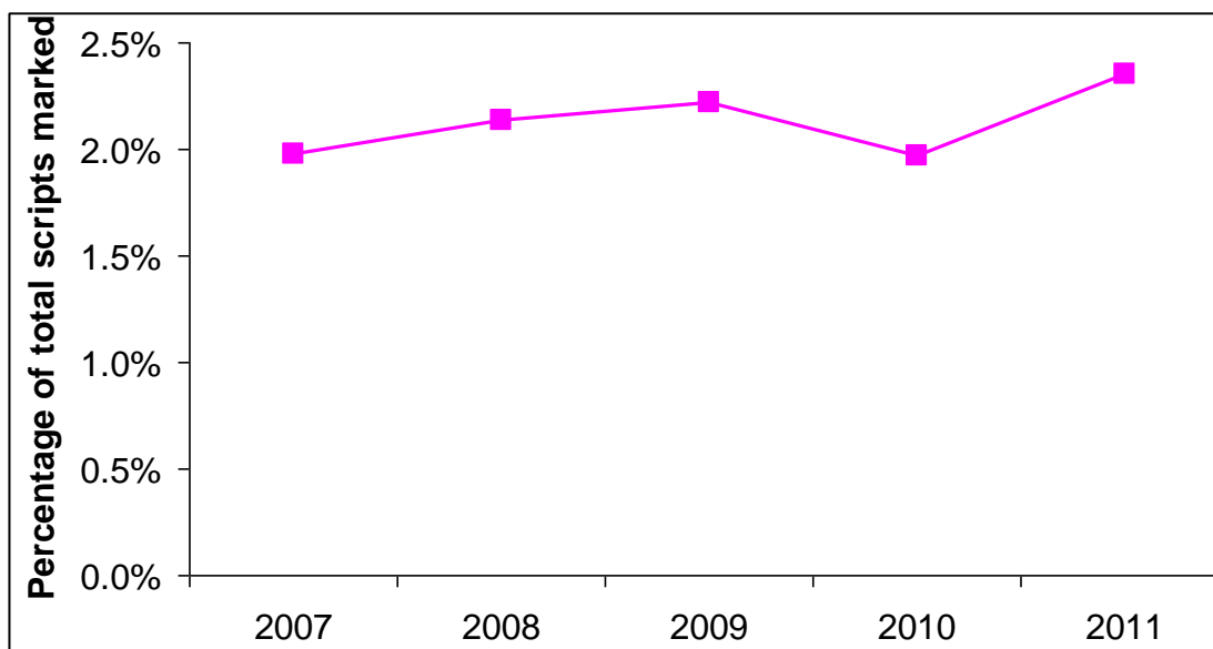
Figure 3: Special considerations as a percentage of total scripts marked, 2007–2011

These figures represent the number of requests for special consideration rather than the number of candidates. This is because an individual candidate may require special consideration for a number of examination papers and is likely to take examinations with more than one awarding organisation for which the same special consideration may be appropriate. Special consideration needs to be requested from each awarding organisation separately.